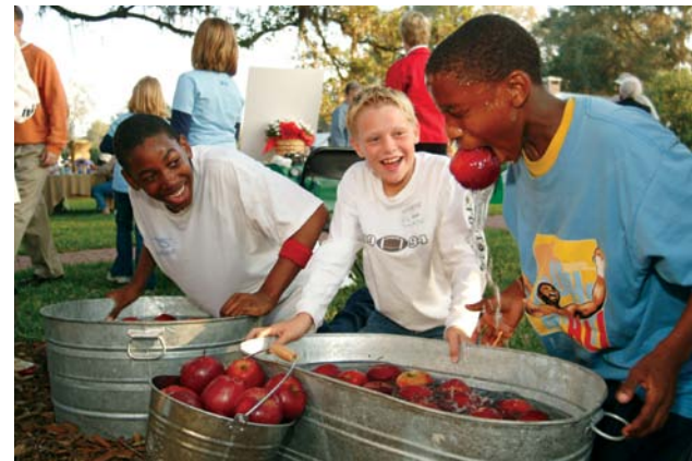
Bobbing for apples is just one of the many activities enjoyed during the Harvest Gathering celebration.