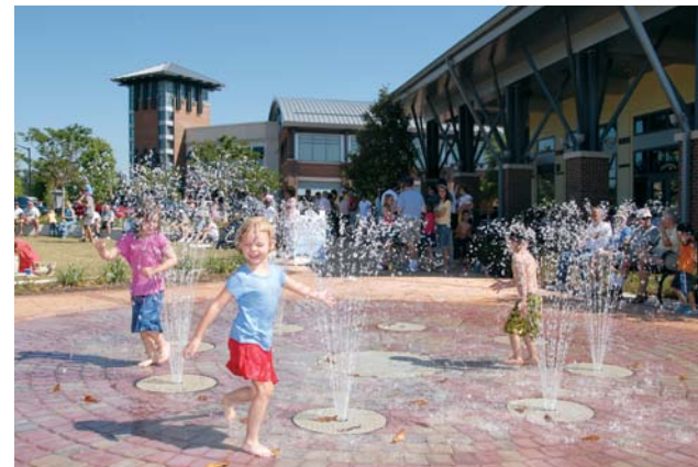
Children enjoy the interactive fountain at Town Center.