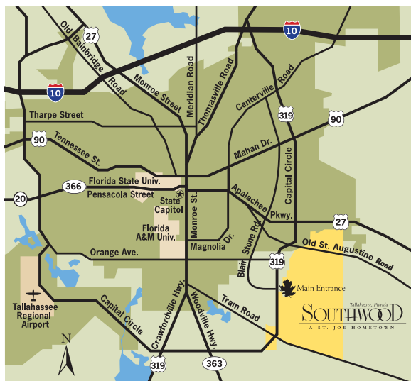
Tallahassee Vicinity Map

SouthWood is located within the city limits of Tallahassee, the capital city of Florida, in Florida's Great Northwest. In a secluded yet central area south of the capital plaza downtown, SouthWood is at the heart of a premier region for Tallahassee's casual Southern living. This new community is approximately 40 miles north of the Gulf of Mexico.