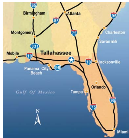
Florida State Map